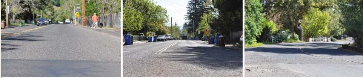
Spring Mountain Road - Proposed for Resurfacing

The beginning of spring last week marked the start of construction for most projects and it was fitting that St. Helena kicked off spring season with City Council approval of $850,000 in road repairs and rehabilitation throughout the city. At Tuesday's March 26th meeting St. Helena Council members unanimously approved a list of proposed streets that would be completed under the St. Helena FY 12-13 Street Repair/Rehabilitation Project. Council approved the list and authorized staff to go out to bid for approximately $16,150 in crack sealing, $132,865 in slurry sealing and $709,504 in resurfacing of streets, which includes roads on both sides of Main Street. The Council cut nearly one million dollars from this year's budget to provide the needed roadway maintenance funding.